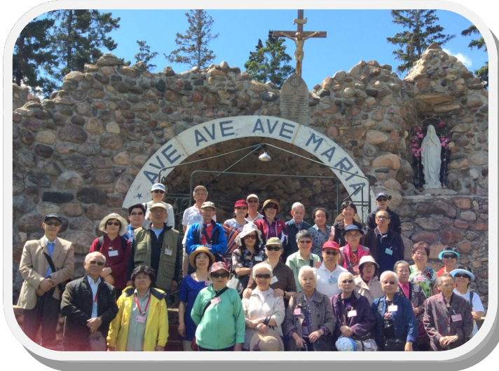
July 20th - Prayers group went on a pilgrimage to Skaro, Alberta. 祈禱宗會前往 Skaro 聖