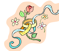
September 16th - Celebrating the 40th wedding anniversary of Iris and Bill Fung after mass - with a huge delicious potluck dinner at the parish's indoor basketball court. 彌撒後，在天主堂室內籃球場舉行豐盛的一家一菜晚餐，